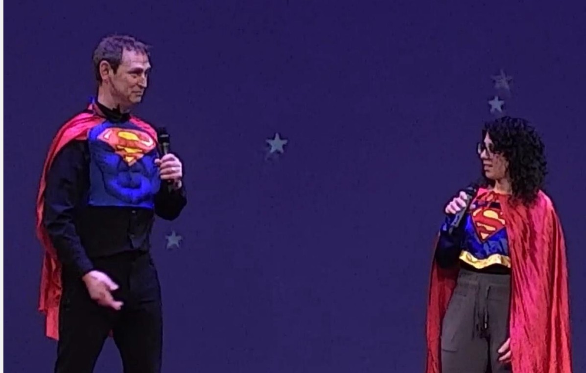
The Campbell River Spirit Awards 2021